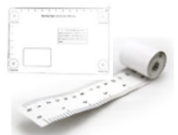
Mounting Paper & Measuring tape