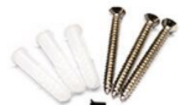
Screws & Holders