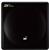
UHF 6Pro Series